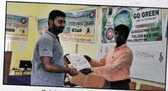
Celebration NSS Day