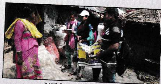
NSS Special Camp