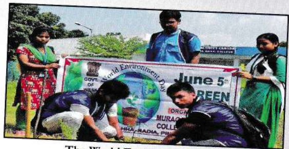
The World Environment Day