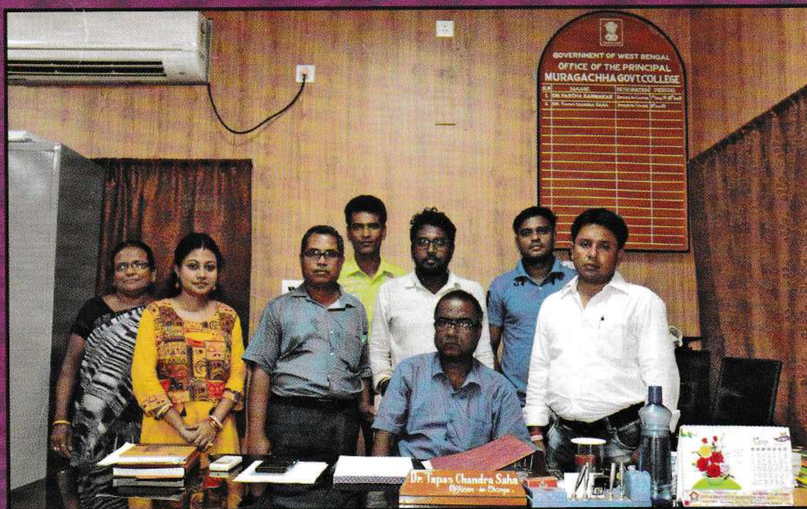
NON-TEACHING STAFF WITH OFFICER-IN-CHARGE