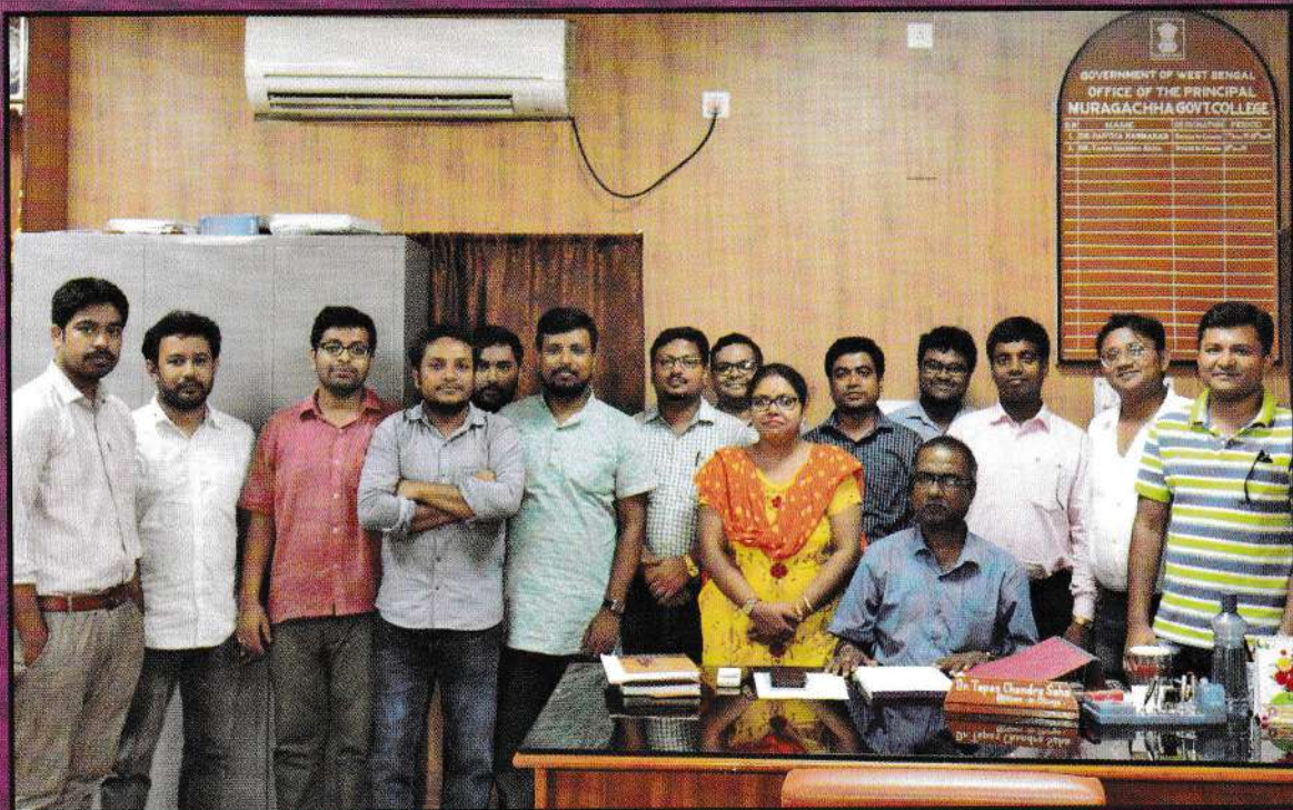
TEACHING STAFF WITH OFFICER-IN-CHARGE