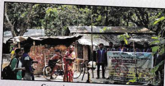
Campaign against Dengue