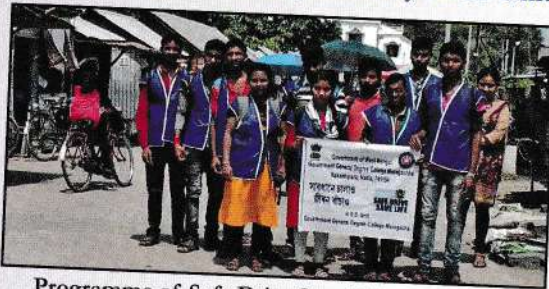
Programme of Safe Drive Save Life