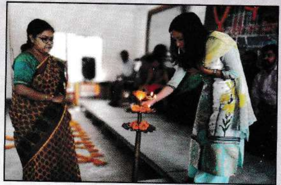
International mother language day - 2019