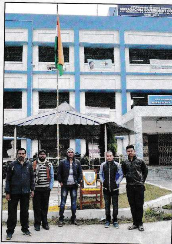
Celebration of 72nd Independence Day