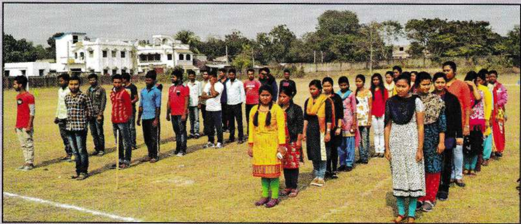
Annual Sports 2019