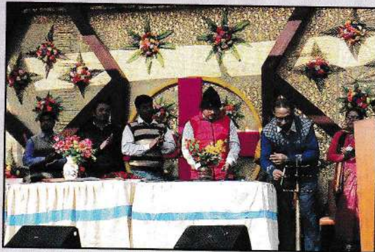
College Social - 2019