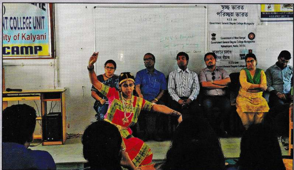
College cultural programme