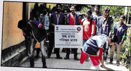
Swachha Bharat Abhiyan