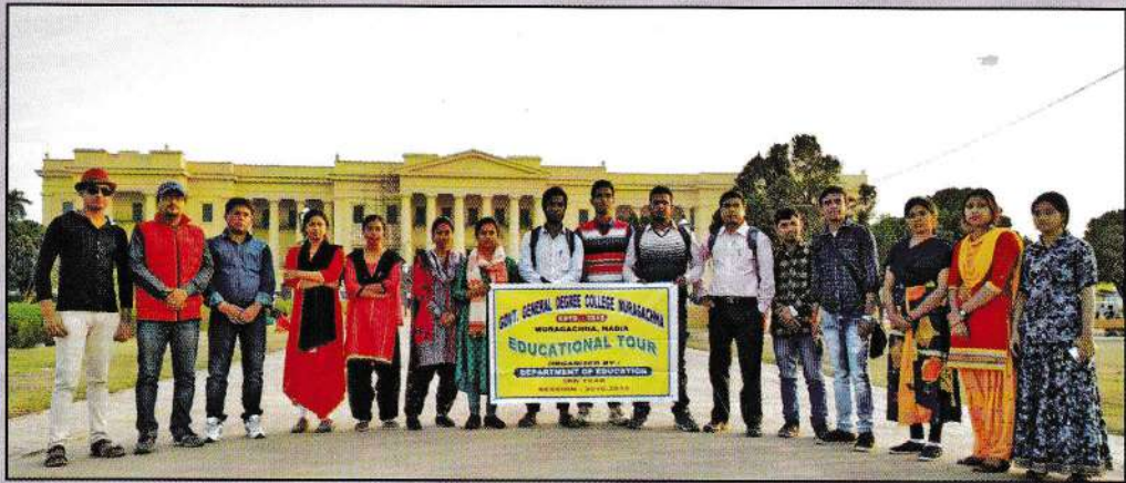
Educational Tour Organized by Department of Education